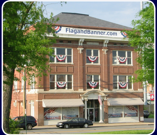
FlagandBanner.com headquarters located within historic Taborian Hall in Little Rock.

FlagandBanner.com has been a community leader in preservation for years. Currently a historic preservation project is under way to restore the Dreamland Ballroom, on the third floor of the Taborian Hall. PBS Network AETN, recognizing the significance of Dreamland, made a documentary and our local college, University of Arkansas at Little Rock, has helped publish a book which is now available on line. In the 1900's, Dreamland Ballroom played a huge part in the history and development of the African American community in Little Rock, hosting legendary musicians such as Duke Ellington, Ella Fitzgerald, Etta James, BB King, Cab Callaway, Louis Jordan, Redd Fox and many more.